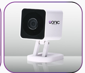
EON+ Vision Access camera