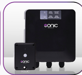
EONConnect Wi-Fi Lifestyle Hub