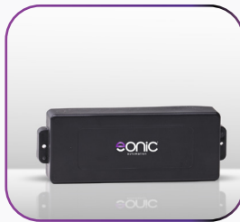
EON+ Battery Back-up