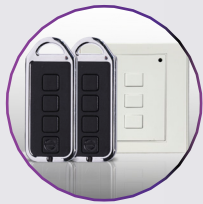
Premium pre-coded handsets for safety & convenience and wall button