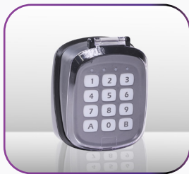
EONIC Wireless Keypad