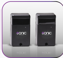
EON+ PE Safety Beams