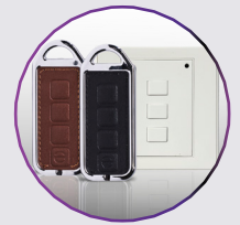
Luxe pre-coded handsets for safety & convenience and wall button